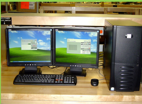
Photo: Instructor Console—Dual Screen System with Analog-to-Digital converter.